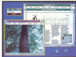
The largest screen in its class, with high-speed accelerated graphics

Measuring 9.5" diagonally in dual-scan STN color, the Ascentia 800N's display is simply unsurpassed — the largest available in a value notebook. And with 16-bit local-bus accelerated graphics, plus a full 1MB of video memory, your graphics-intensive applications light up the screen in an instant.