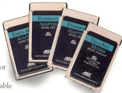
Two PCMCIA slots for expansion and connectivity

No other value notebook is quite so versatile. Because with multiple PCMCIA expansion slots, the Ascentia 800N leads the way in expansion and connectivity options. Add a data/fax modem, and access E-mail, or on-line services. Incorporate a SCSI card, ethernet, token ring, or simply add storage, with any of a vast array of cards available from AST or third-party manufacturers. Our PCMCIA card and socket services software assures compatibility with over 180 cards.